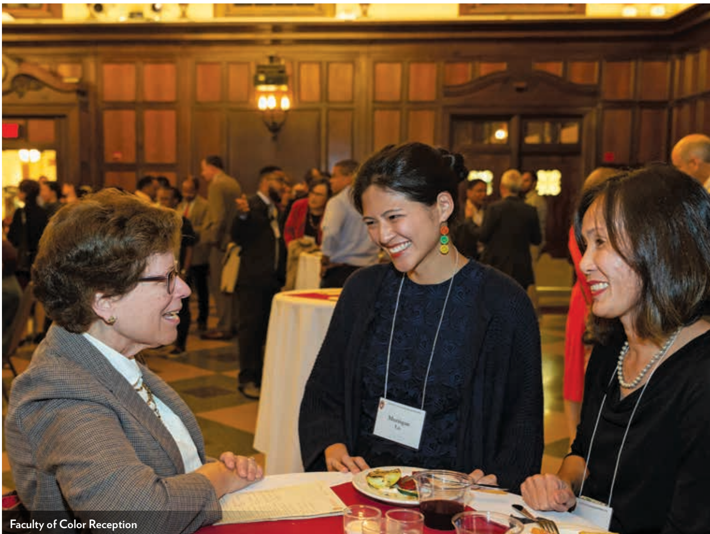
Faculty of Color Reception