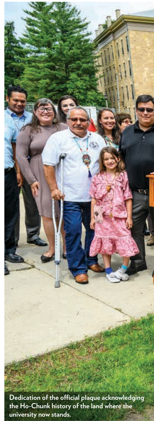
Dedication of the official plaque acknowledging the Ho-Chunk history of the land where the university now stands.