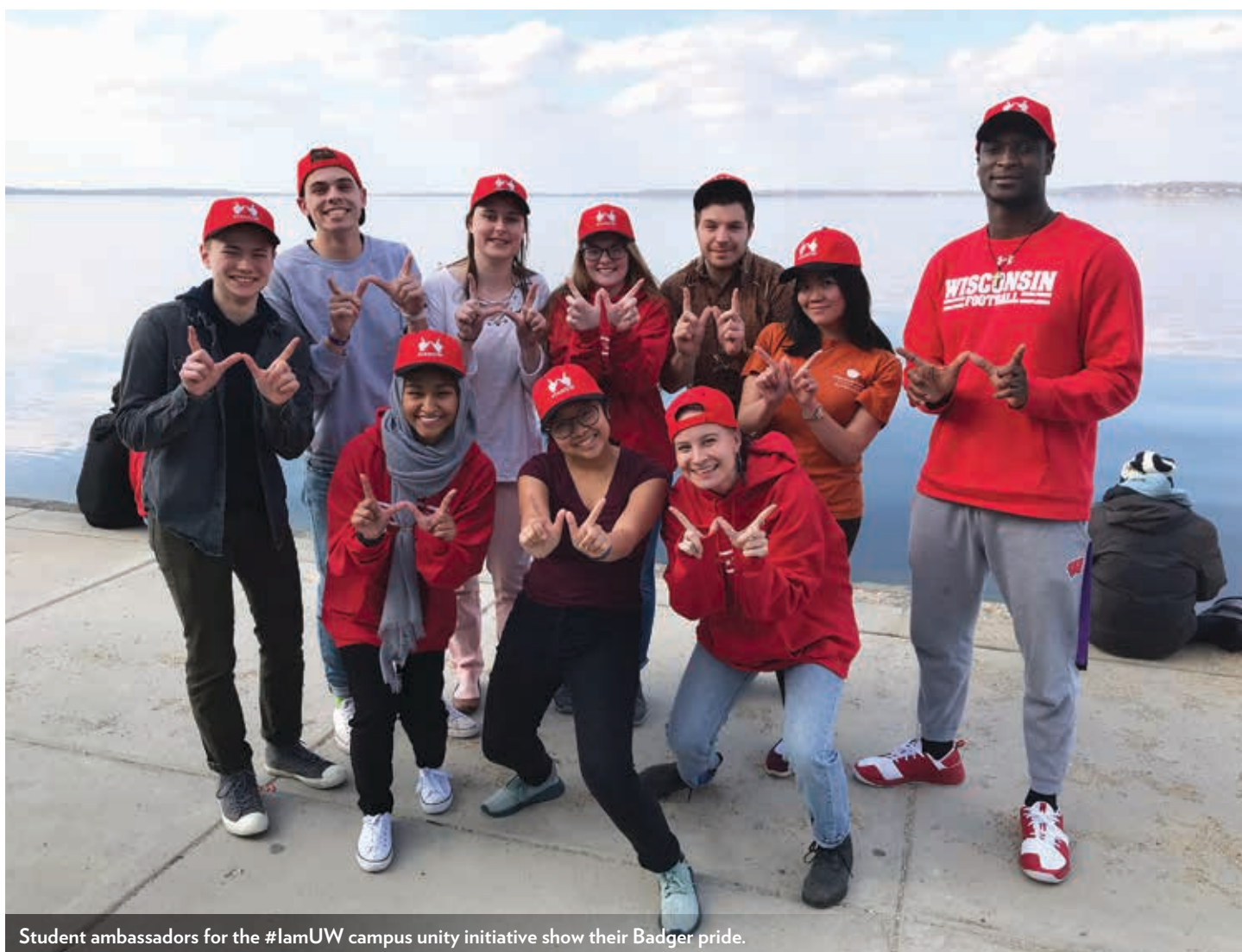
Student ambassadors for the #IamUW campus unity initiative show their Badger pride.