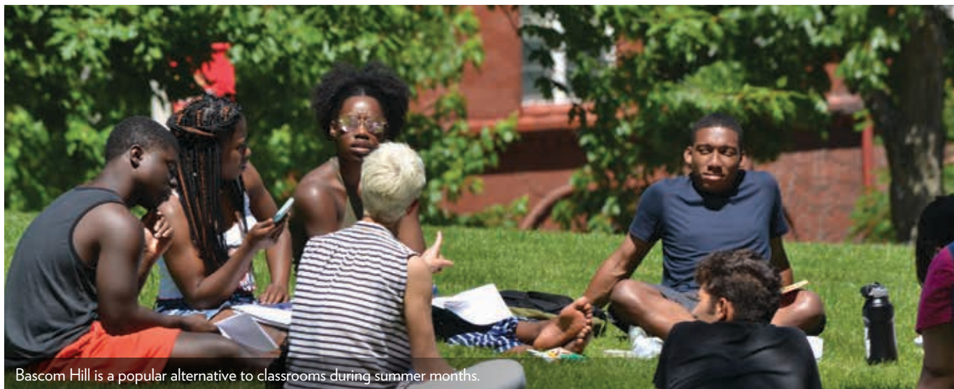
Bascom Hill is a popular alternative to classrooms during summer months.