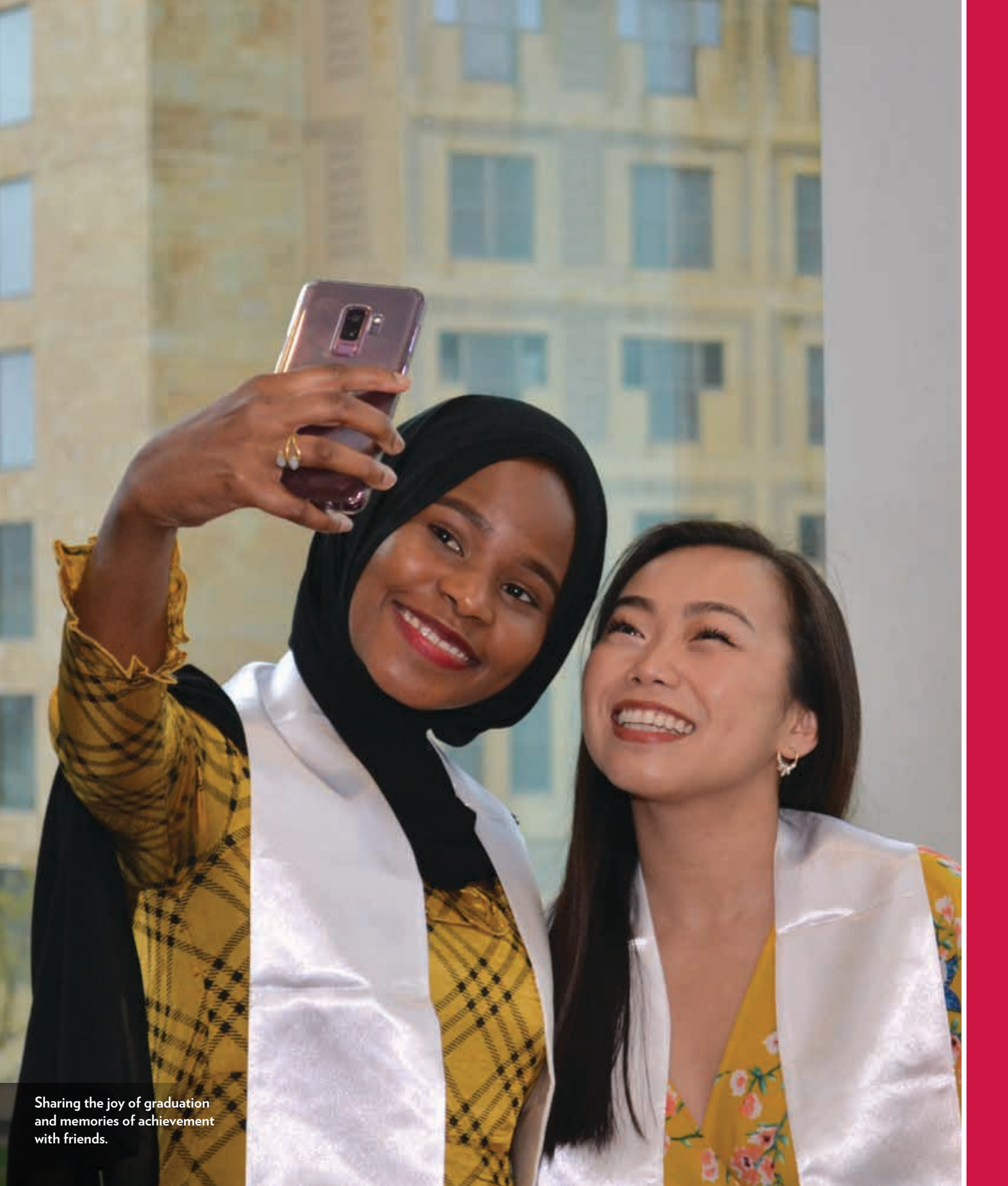
Sharing the joy of graduation and memories of achievement with friends.