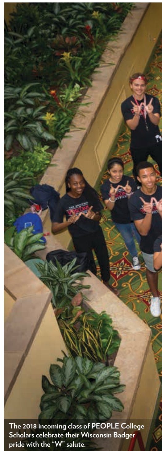
The 2018 incoming class of PEOPLE College Scholars celebrate their Wisconsin Badger pride with the “W” salute.

More than 70 students and two dozen alumni attended the program’s first Alumni Connections event in collaboration with the Wisconsin Alumni Association and the College Scholars Advisory Board.