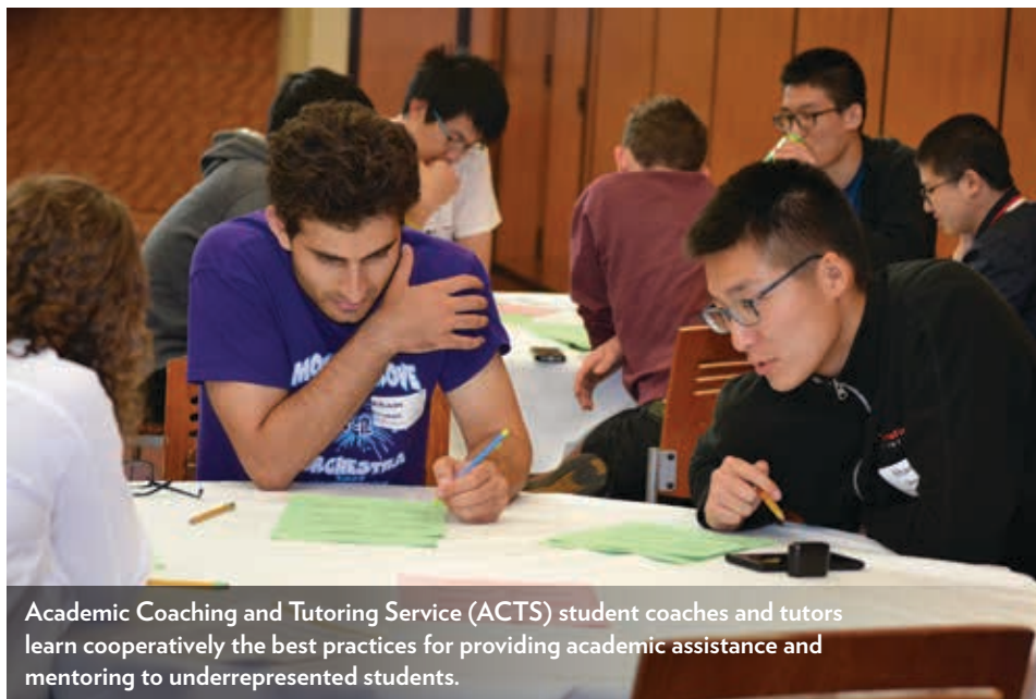
Academic Coaching and Tutoring Service (ACTS) student coaches and tutors learn cooperatively the best practices for providing academic assistance and mentoring to underrepresented students.

The program began its new life as a standalone unit within the DDEEA, moving into its new offices in the Middleton Building in January 2019 and launching a new website and social media presence. As a longstanding service with a new name, ACTS began an effort to raise awareness of the office and its services for DDEEA scholars, including leading or participating in more than a dozen training events for students focused