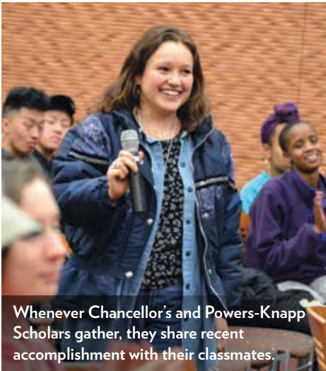
Whenever Chancellor's and Powers-Knapp Scholars gather, they share recent accomplishment with their classmates.

experiences than the general university population by the time they graduate. That is because those practices are at the core of the DDEEA's student programs and are part of their organizing philosophy. In 2017-18, graduates from the First Wave program had 100% participation in residential learning communities and a first-year interest group. Additionally, 71% of PEOPLE graduates participated in a first-year interest group, 58% and 61% of Chancellor's and Posse graduates participated in an undergraduate research experience, respectively, and graduates from the CeO and Powers-Knapp programs had 62% and 56% participation rates in capstone experiences.