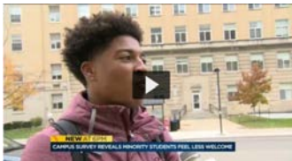
Channel 3000 Coverage of Campus Climate Survey View Story