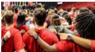
Chronicle of Higher Education Feature Read More